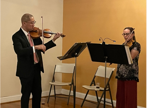
We were serenaded with musicians from St. Mary's!